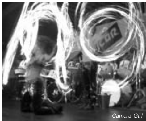
The Mutaytor spins fire at Flambe Lounge.

Truth has no path. God likes to hide. Belief is faith, Commodified.