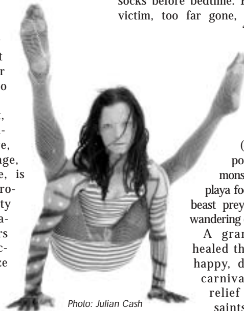
One way to avoid playa foot.

After the closing credits, a long shot of the open playa zooms in on a crack in the dust. A snarling "Phantom Playa Foot Fiend" cackles maniacally, leaving open the possibility for a sequel. But where's the sequel going? Presumably nowhere open toed! Checking in on your shoe business, spiritual and otherwise, Playa Shoe Whore Sez; "Wear em and work em." *