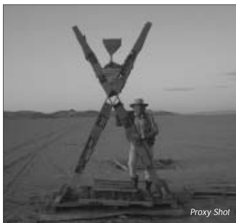
Danger Ranger built a man for the Summer solstice...

Don't want them to think you go to a naked hippy-fest desert thing? Then wash the playa dust out of your hair, put on some damned clothes, lose the patchouli oil and strike the word "vibe" from your vocabulary. Finally, do the honorable thing and slowly peck your own eyes out as punishment for your misguided ways. You still may not regain the respect of your coworkers, but I'll certainly sleep better. *