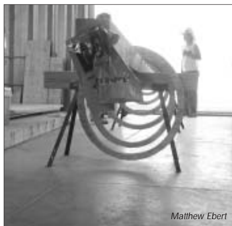
A piece of the Man takes shape at the Ranch.