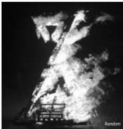
And then he burned it!